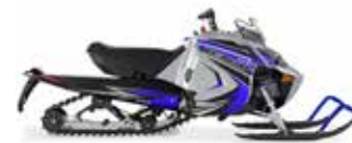
Frost Silver / Team Yamaha Blue