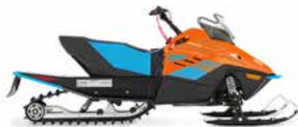
Jet Orange / Jet Stream Blue

What a powerful investment – developing your child's appreciation of the great outdoors to serve them a lifetime filled with healthy, active, fun times.