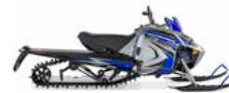
Frost Silver / Team Yamaha Blue

2-Stroke, Single-Cylinder, Liquid-Cooled EFI Engine CVTech® Drive System Electronic Reverse Lightweight Chassis 14" x 121" x 1.0" Camso® Hacksaw Track Digital Gauge Battery-less Fuel Injection 38-inch SRV Front Suspension Handle Bar and Thumb warmers Electric Start