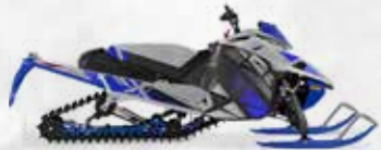
Frost Silver / Team Yamaha Blue