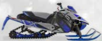
Frost Silver / Team Yamaha Blue