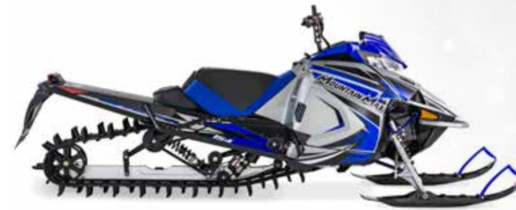
Frost Silver / Team Yamaha Blue