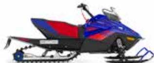
Team Yamaha Blue / Red