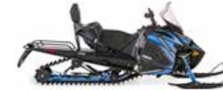
Ice Blue / Frost Silver

2-Stroke, Single-Cylinder, Liquid-Cooled EFI Engine CVTech® Drive System Electronic Reverse 146" Utility Suspension with Flip-up Rails 146" x 1.6" inch Cobra Track Yamaha Mountain Ski 38-Inch SRV Front Suspension Track Flip Rail Lock-Out Large Capacity, 11.7 USG (44 L) Fuel Tank Rear Storage Rack