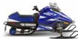
Team Yamaha Blue