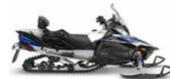
White / Blue