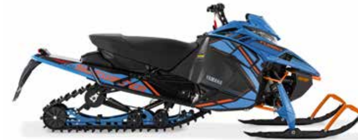
Ice Blue / Jet Orange