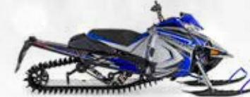
Frost Silver / Team Yamaha Blue