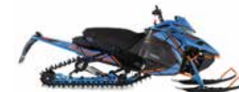
Ice Blue / Jet Orange