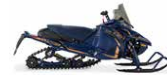
Ink Blue / Regal Gold