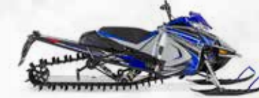
Frost Silver / Team Yamaha Blue