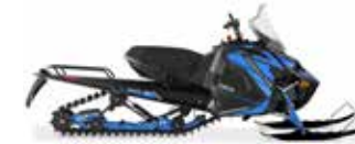
Ice Blue / Frost Silver

2-Stroke, Single-Cylinder, Liquid-Cooled EFI Engine CVTech® Drive System Electronic Reverse Mountain Single-Beam Suspension 146" x 2.0" Challenger® Track Yamaha Mountain Ski Tall Handlebars