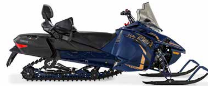
Ink Blue / Regal Gold