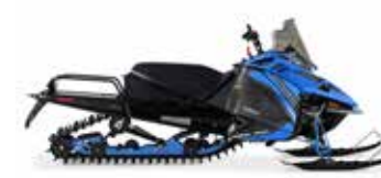
Ice Blue / Frost Silver