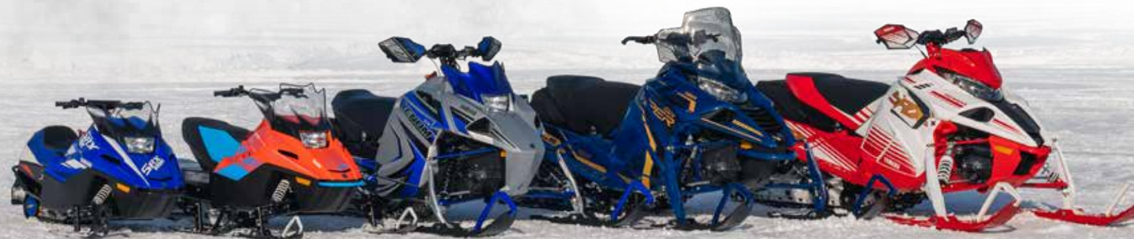
Pre-production model shown. Production model may vary. Some models shown with optional accessories.

Look closely and you will find your best options to enjoy winter on a high-quality Yamaha snowmobile.