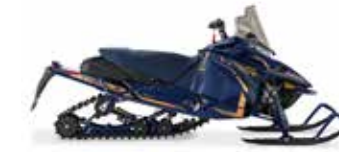
Ink Blue / Regal Gold